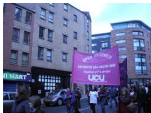
OU UCU members carrying a branch banner in Glasgow, 20 Oct 2012

Further information about the demonstration is at: http://afuturethatworks.org